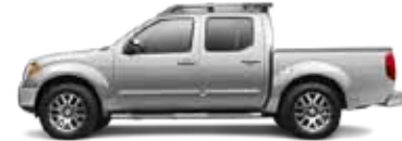
LE: KING CAB AND CREW CAB