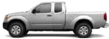
XE AND SE 4-CYLINDER: KING CAB