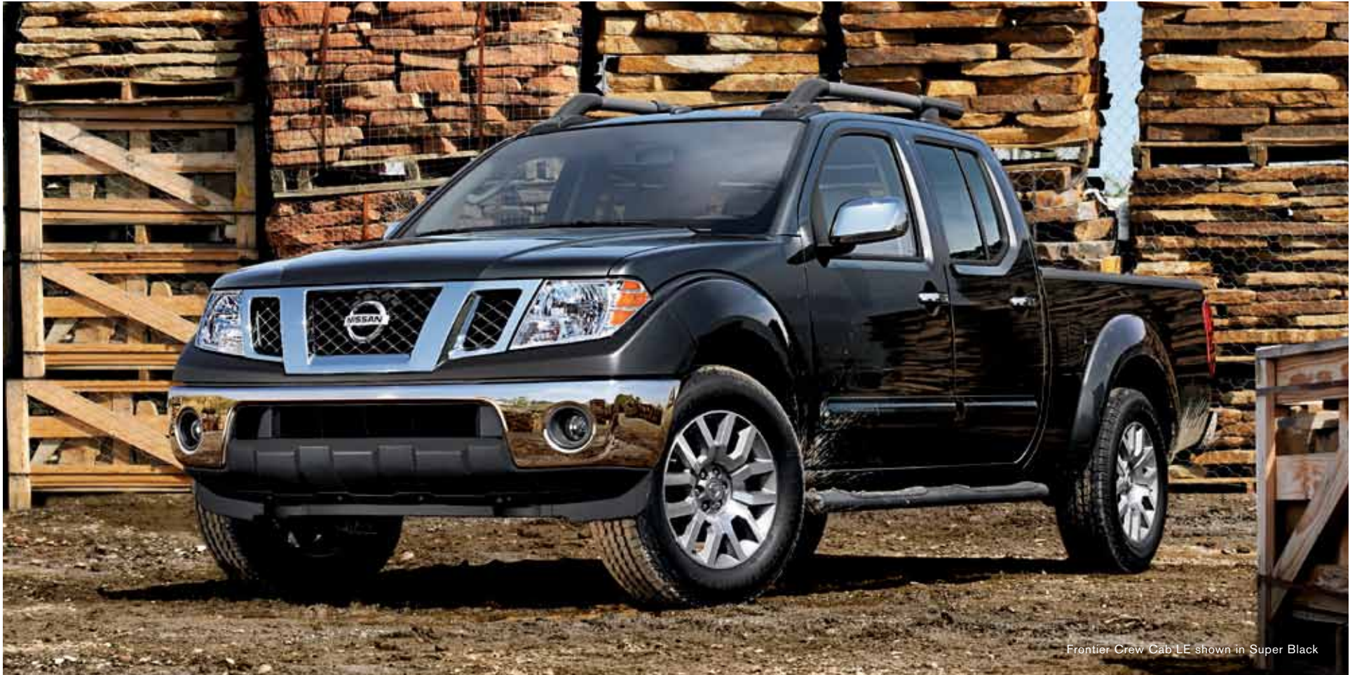
Frontier Crew Cab LE shown in Super Black