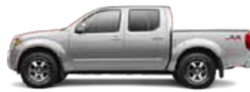
PRO-4X: KING CAB AND CREW CAB