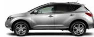
LE: PORTRAIT OF LUXURY