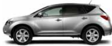
S: REDEFINITION OF ADVENTURE