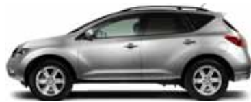
SL: STATEMENT OF BEAUTY