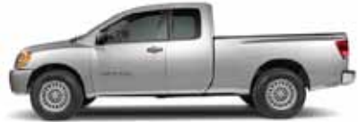
XE KING CAB AND CREW CAB