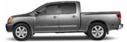
LE CREW CAB