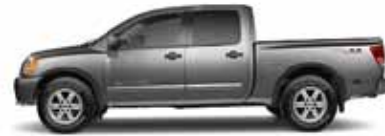
PRO-4X KING CAB AND CREW CAB