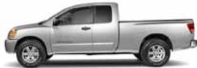
SE KING CAB AND CREW CAB